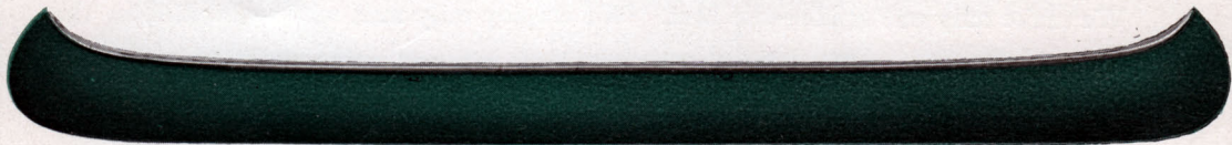
Side view of our Canoe, showing the lines of the bow and stern. Inside, natural wood oiled and varnished. Outside can be painted any color desired.