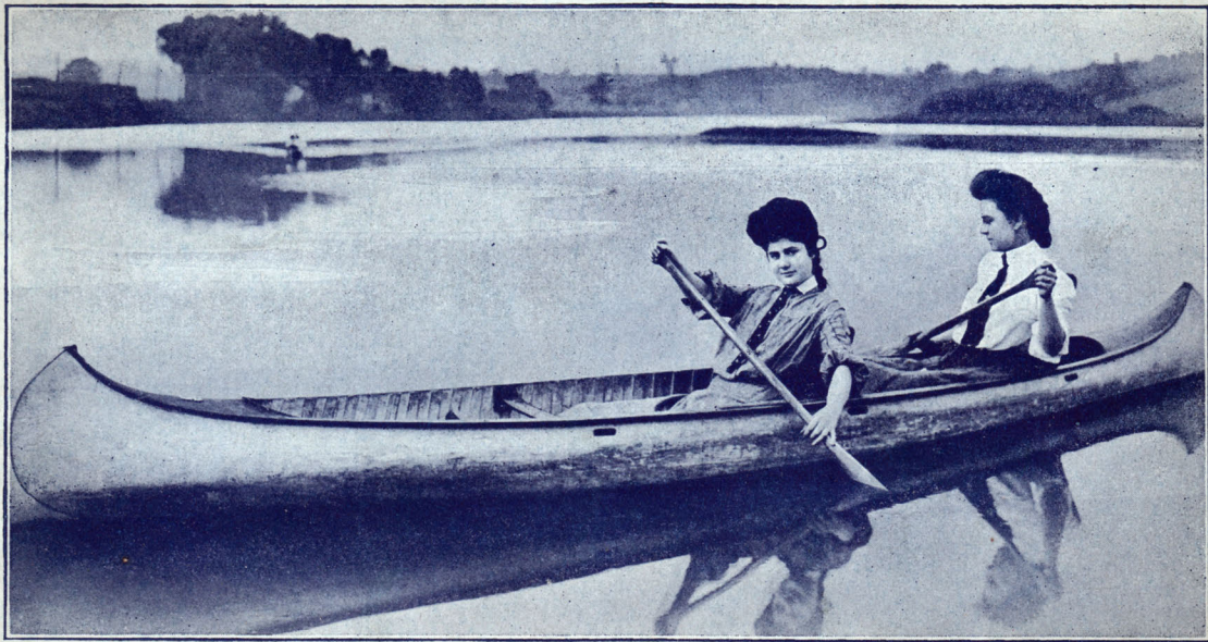
The Detroit Canoe and Oar Works, Detroit, Michigan